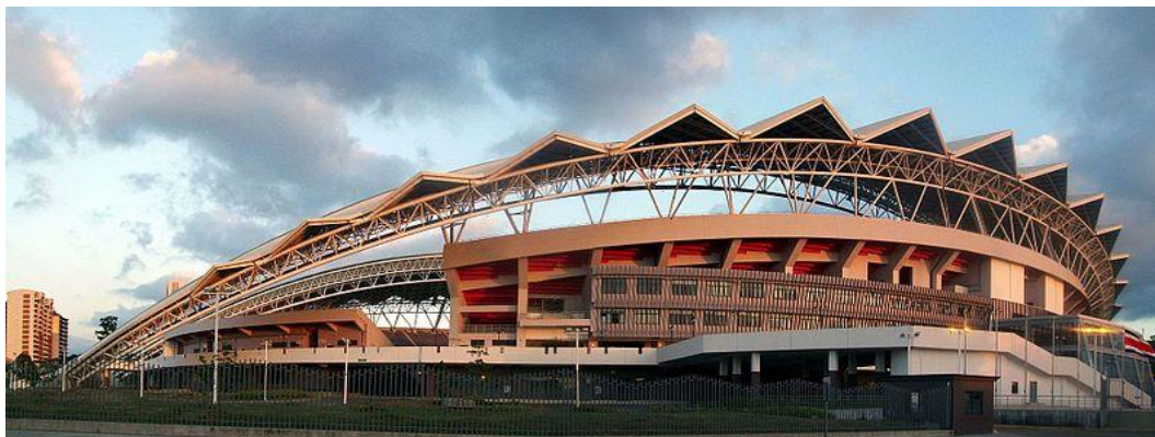
Costa Rica's National Stadium, Sam Jose, Costa Rica

National Stadium Performance - Your group will have a performance for the game opening, a half-time presentation show, plus an extra presentation at the end of the game, upon request. The audience is expected to be very, very large. Dependent upon dates booked, this opportunity will most likely fall on a Thursday as these are when the soccer games are played in Costa Rica. Soccer is the top sport in the country.